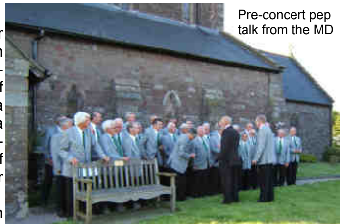
Pre-concert pep talk from the MD

We were privileged to see around the home and gardens of one of Britain's best known comedians and to experience the tranquility of the setting which must have provided him with such a welcome contrast from a hectic life in the public gaze.